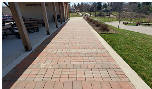
The Red Walk located at the Baierl Athletic Complex allows you to honor a loved one, remember a coach or teammate all while paving the way for today's student athletes.